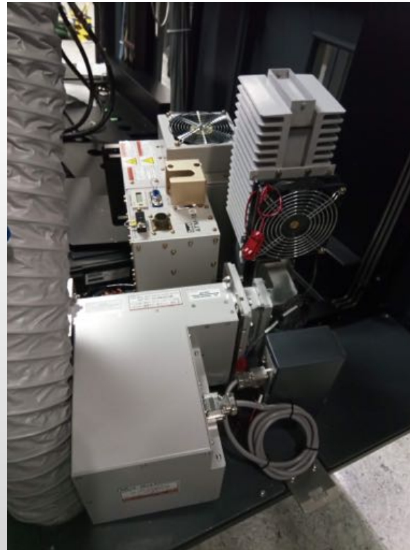
Microwave generator & waveguide